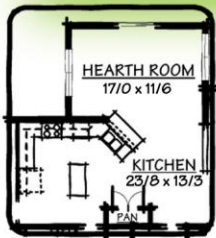
Optional Hearth Room